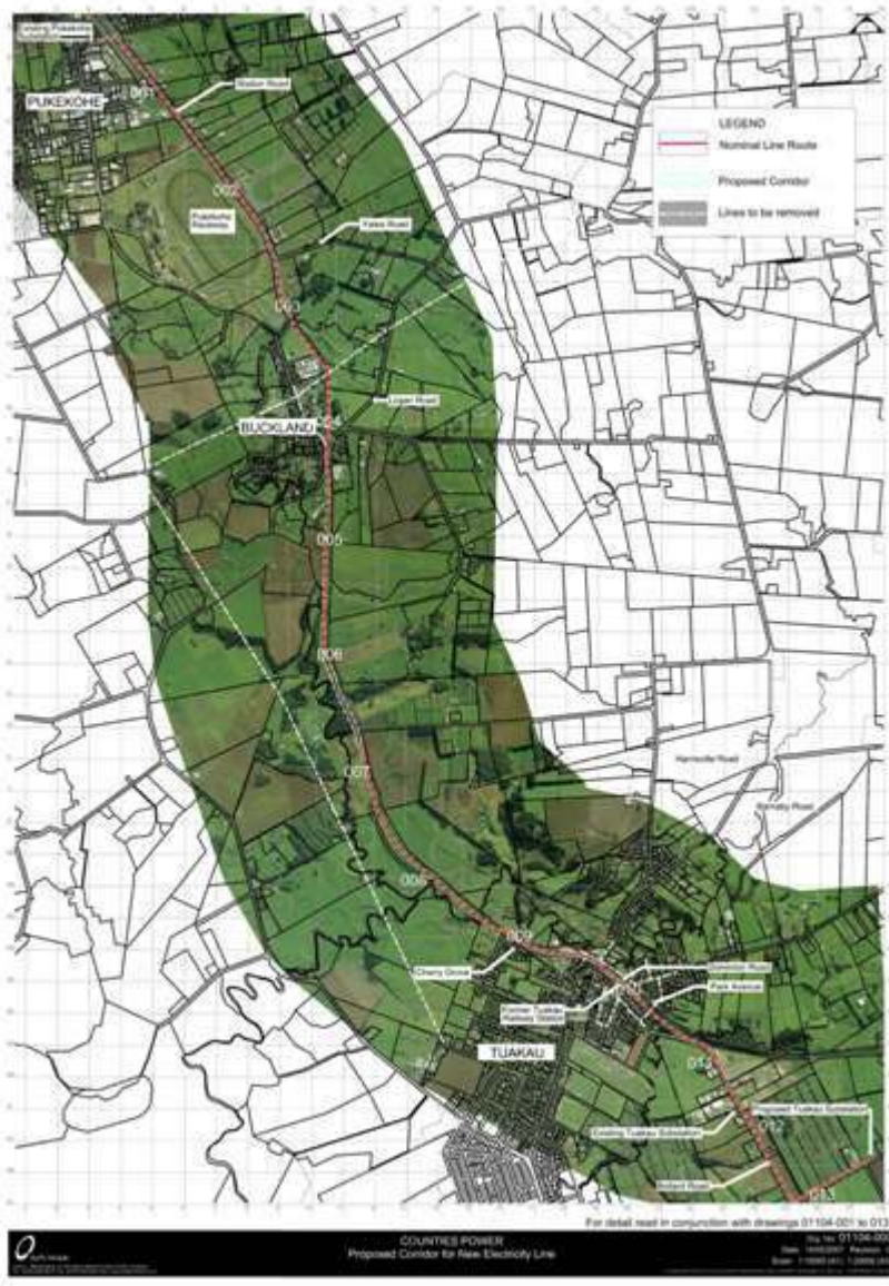
Figure 2: Drawing 01104 019